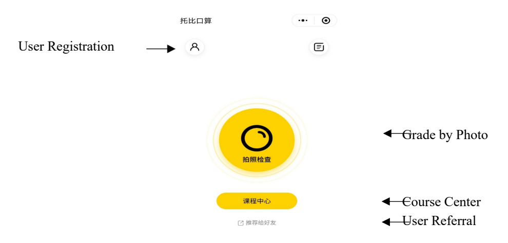
Fig. 2. A Screenshot of the WeChat Mini-program Interface

app, but it resides in the WeChat ecosystem instead of existing as an independent app on the smartphone. The main function of the mini-program is to take a photo of the paper workbook to initiate the automatic correction service. Users may accumulate points by registering, using the automatic correction service, or recommending this mini-program to their friends. Users can use these points to redeem tutoring courses offered in the course center.