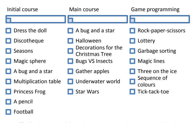
Fig.2. The names of Scratch game programs that match each level