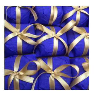
Figure 1: Examples of images considered good and bad from the Elo7 website