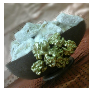
(b) Image with a low click score

different categories and a hundred thousand unique queries across two months (October and September of 2018).