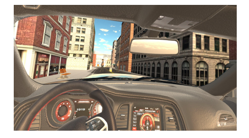
Figure 1: Participant is seated as passenger. On the crossing ahead there is a pair who differ in body size.

is designed so that participants are seated in the driver's seat of a car. The car has detailed interior to increase realism and thus immersion. The car, positioned on the left hand lane as the experiments took place in the UK, drives through a city environment and approaches a zebra-crossing. There are nonplayable characters, of the various "physical types" described in Section 3, crossing the road. There are eleven scenarios in total, of which one is a practice and thus devoid of characters.