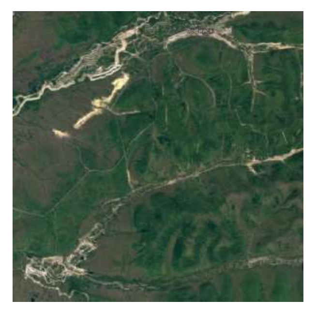
Figure 1: Plot Sophiysky ore-placer field

The remaining sites are marked as available. The optimal location for the DP and the routes from the deposits to the plant are determined during the calculation of the mathematical model.