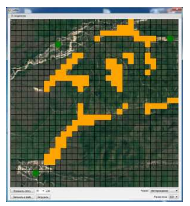
Figure 2: The position of deposits and inaccessible areas