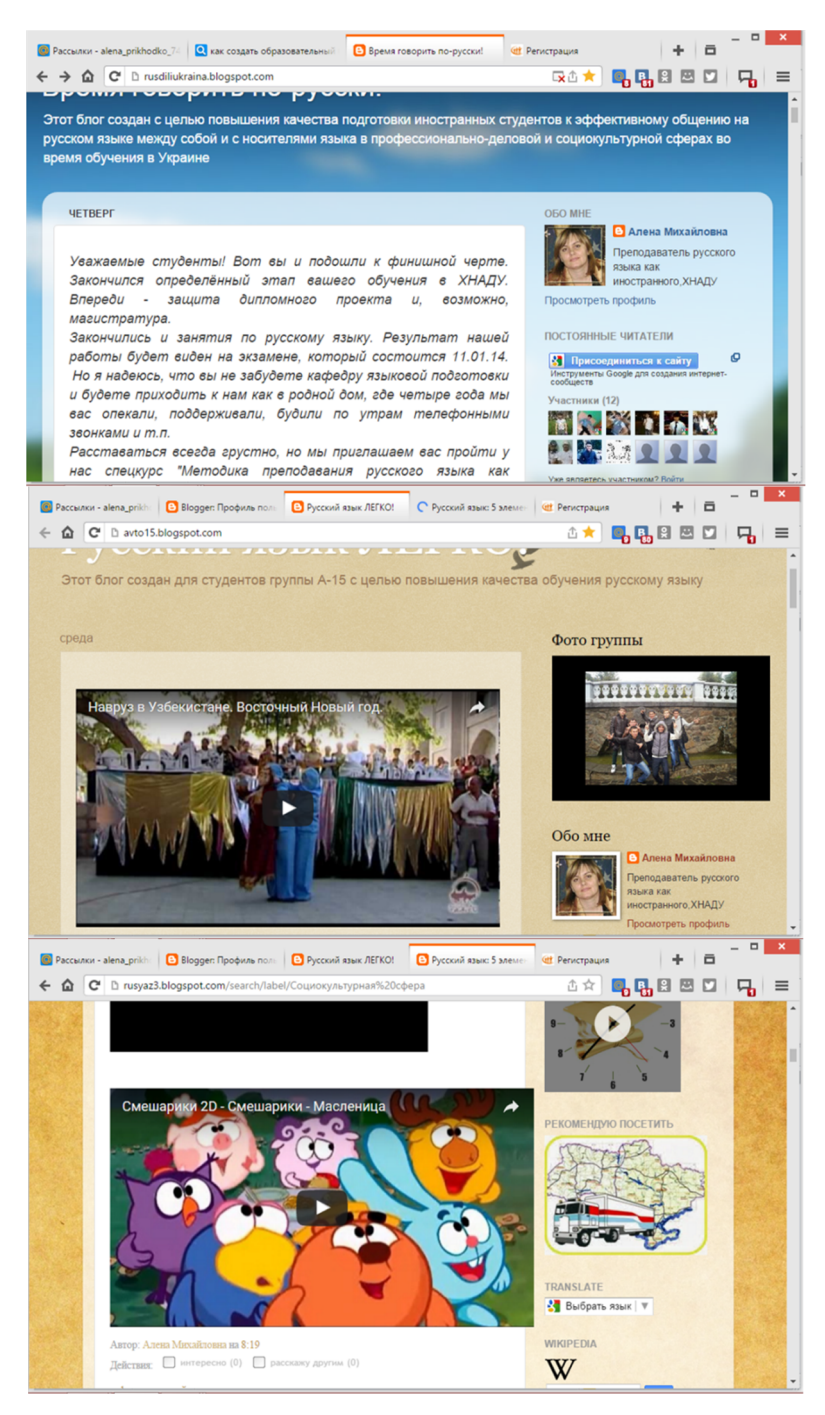
Fig. 1. Exemplary screenshots of educational blogs