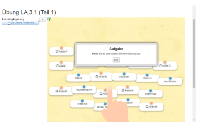
Fig. 3. Interactive LearningApps page