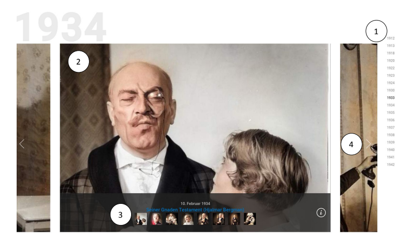
Fig. 2: Linked Stage Graph Viewer

the Coding da Vinci Süd hackathon and was awarded the prize for the "most useful" application. Even though the presented demo implements a use case on theater data only, it is generalizable to a broad range of archive domains since the EAD-XML format is widely used in archives. Future work will involve the improvement of the underlying ontology, a more exhaustive entity linking and further means of visual exploration beyond timelines.