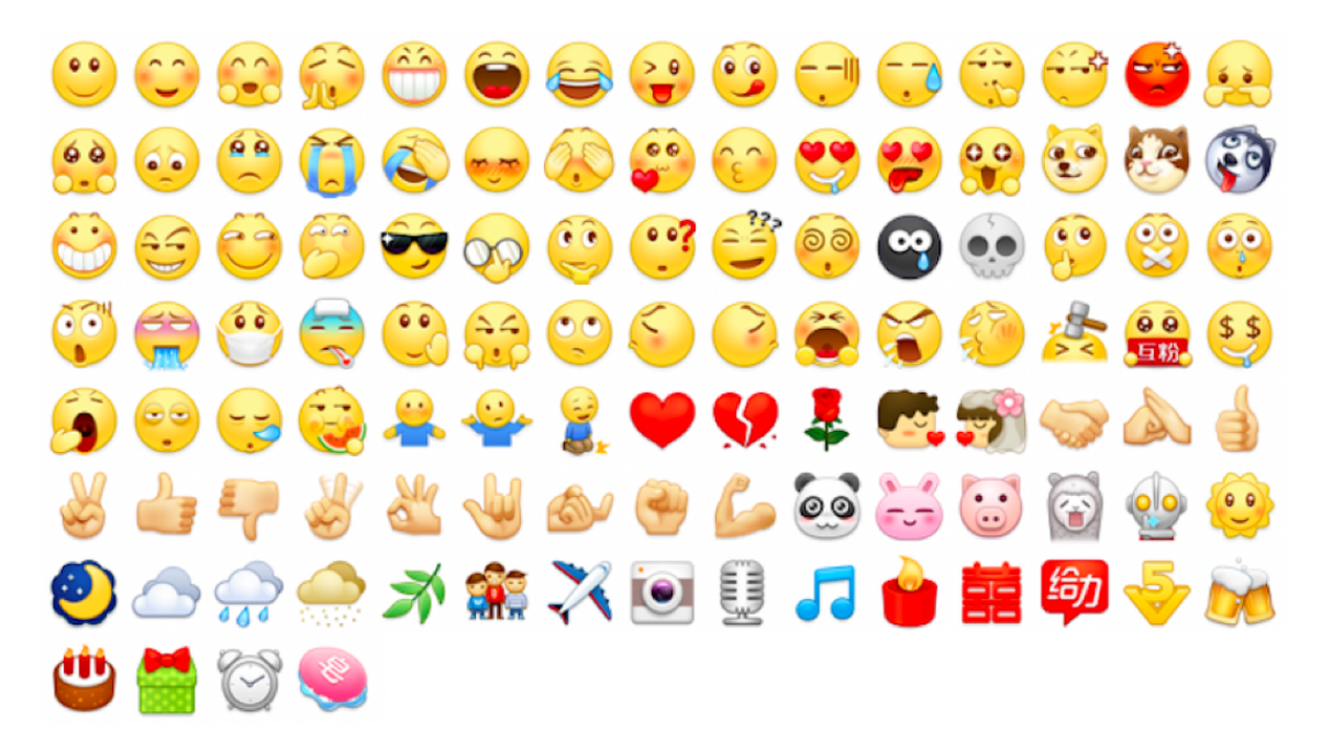
Figure 3: 109 Weibo emojis which were converted into Chinese characters.