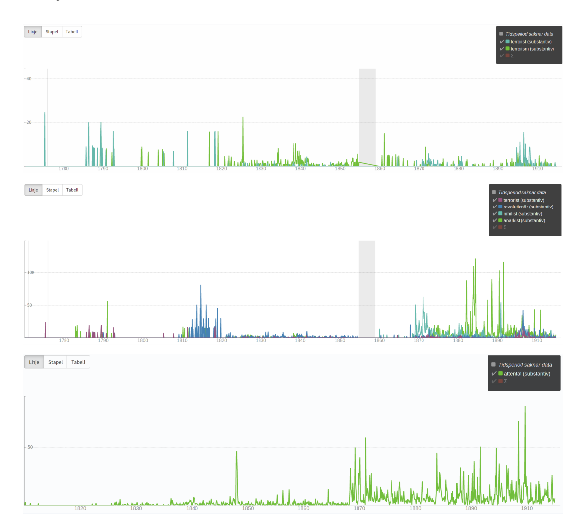
Figure 1: Trend graphs for terrorist/terrorism (top), terrorist/anarkist/nihilist/revolutionär (noun) (middle), and attentat (bottom) for the period 1780–1914

anarchism, which supports and strengthens the hypothesis that terrorism have not reached its modern meaning during this period.