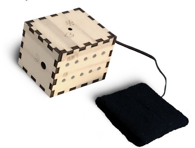
Figure 1. The rough prototype of the Avatar.

events, its blood freezes and the player must warm up the avatar, just as she would do in a real world situation.