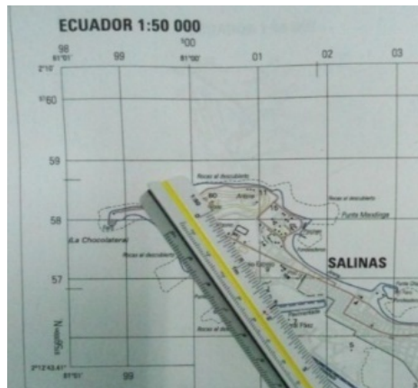
Fig. 4. Topographic Map, which is used to measure distances through scales.

The sparks ignition is immediate and it can be seen by the human eye, it represents the reference to start timing using the chronometer, it stops once the gunpowder explosion is heard. The distance is determined in exact coordinates using a topographic map and a GPS which measured 1240 mts; there were collected eight samples per student and; as a result, it was gathered 357