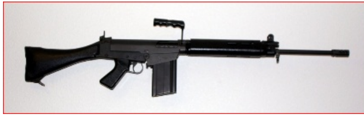
Fig. 1. FAL Rifle used during military training

The FAL rifle is a Belgian battle weapon, it is chambered for the 7.62 \times 51 mm NATO cartridge. The word FAL comes from the French acronym “Fusil Automatique Léger” which is translated in English as Light Automatic Rifle [9]. It is illustrated in Fig. 1, and it is used during the military training at the Air Force Academy.