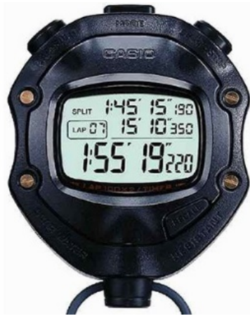
Fig. 7. A Casio chronometer.