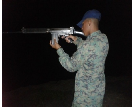
Fig. 3. Each student had 8 attempts.

the sound produced by the gunpowder explosion during each shot to calculate distances. This study took place in the province of Santa Elena, in the city of Salinas, at the Military Aviation School which is located in the parish of Chipipe. It was used a FAL rifle, which was chambered for the 7.62×51mm NATO cartridge, each student had 8 attempts at a temperature of 22° C at 7:30 in the evening, as it is illustrated in Fig. 3.