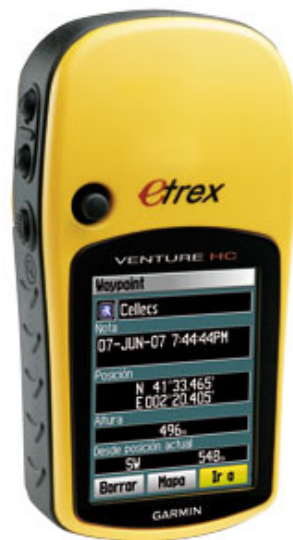
Fig. 5. GPS, it was used to measure distances.

measurements and only 3 shots were dismissed. It is important to mention that the speed of sound is independent of the pressure, the frequency and the length of the waves [4], that is why these factors did not interfere with this research.