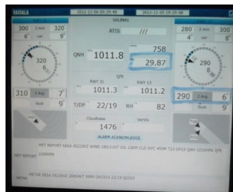
Fig. 6. Instrument applied to determine meteorological conditions, in this case, the temperature.

The measuring instruments used for this study were: topographical map, chronometers (CASIO), GPS (GARMIN Etrex), meteorological measuring equipment (VAISALA), which are illustrated in Fig. 4, Fig. 5, Fig. 6 and Fig. 7.