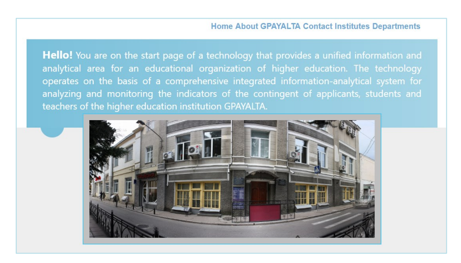
Fig. 1. Starting web page GPAYALTA

The integration of electronic educational resources, as a subsystem of the informationanalytical environment of the university, is necessary to ensure on-line access for students and teachers, to systematize and manage the educational process.