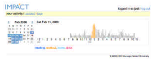
Figure 1. Prototype of a reflective visualization, indicating the amounts of physical activities conducted while performing everyday activities.

Ambient displays receive varying and unpredictable levels of attention. Understanding what design variables might minimize the demand for attention, and help people to become more self-aware through information interactions, is a rich area for exploration. While many novel ambient display designs have been proposed for everyday environments [2, 3, 4, 7, 8], most are point designs in a