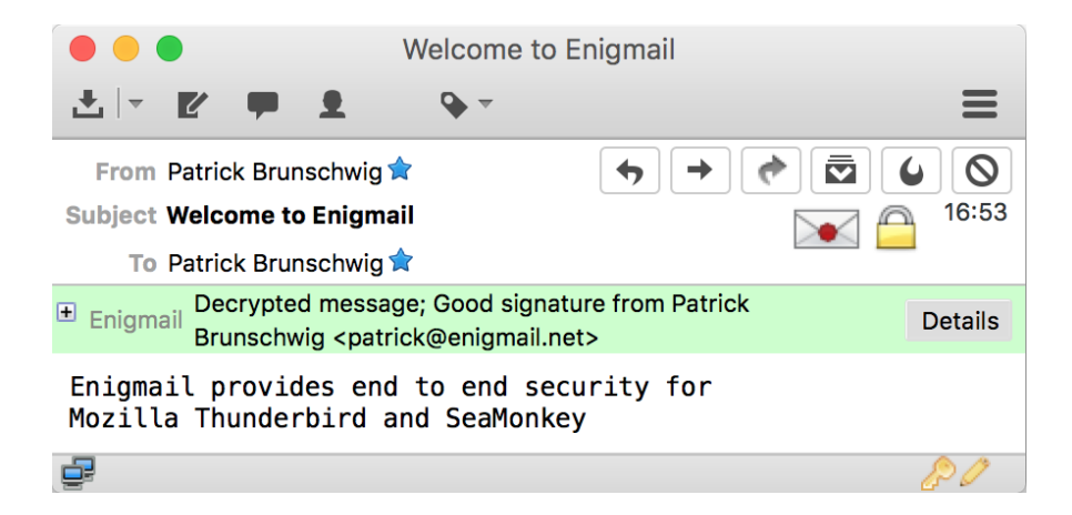
Figure 1: Enigmail security indicators

understandable presentation of the different privacy states that messages and communication peers can have[16]. The design choices regarding the indicators within p≡p diverge from those of other applications, and how this reflects on users has not been studied before. Furthermore, other secure email apps also differ from one another. Overlooking that Lausch et al. [15] discuss that an "envelope" in various conditions (e.g. broken, closed, open) is a better metaphor than a "padlock" in its various forms (e.g. open or closed, and red or green-coloured), applications opt for their own security icons and metaphors—for instance, the popular open-source Enigmail³ for Thunderbird uses padlocks for confidentiality and sealed envelopes for authentication and integrity (see Figure 1). The reasoning underpinning choices is often not explicitly stated.