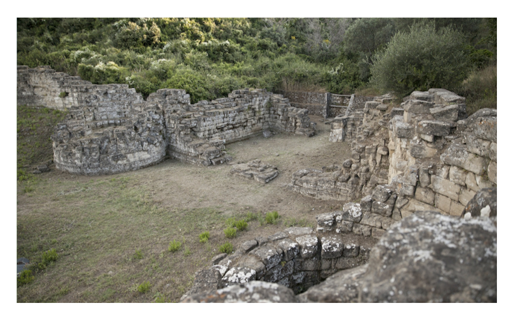
Figure 5: The south-east gate.

Example of the application of augmented reality for a POI in the archaeological park of Castiglione di Paludi. We report an example of a point of interest to be enhanced through the use of a 3D model in augmented reality: it is the south-east gate, the main entrance to the city. Figure 5 shows the south-east gate and its tower.