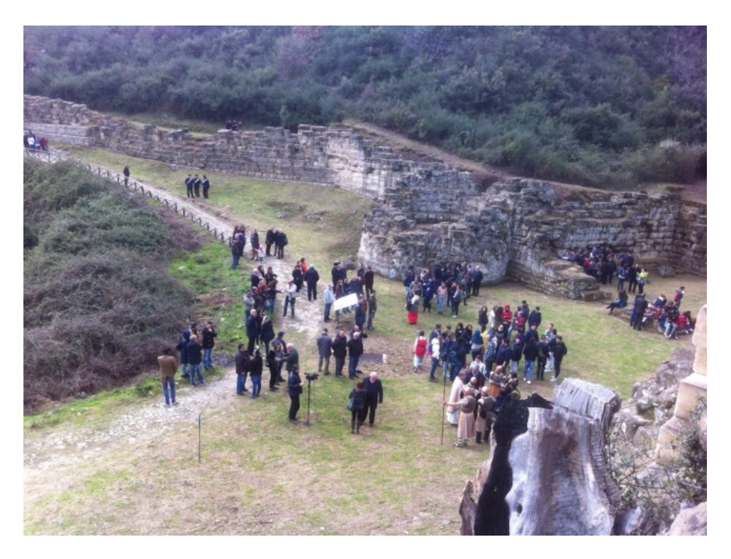
Figure 2: The Archeological Park of Castiglione di Paludi

The objective of this paper is to disseminate information about a territory, Calabria, famous for being one of the regions belonging to Magna Graecia and rich in archaeological heritage. Specifically, it presents a project proposal that uses ICT technologies and augmented reality in the domain of cultural heritage, to promote new keys of reading and knowledge of the territory so that providing the visitor (also the disinterested one) with