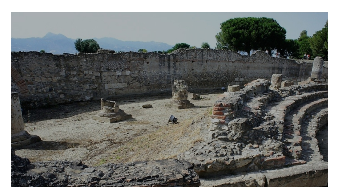
Figure 9: The theater in the archeological park of Sibari.

Example of the application of augmented reality for a POI in the archaeological park of Sibari. We report an example of a point of interest to be enhanced through the use of a 3D model in the archaeological park of Sibari (Figure 9).