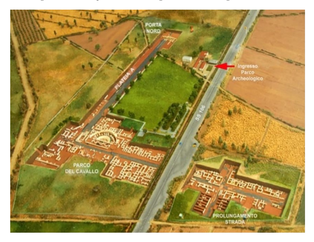
Figure 4: The map of the Archeological Park of Sibari