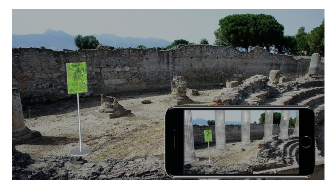
Figure 12: The mobile app.