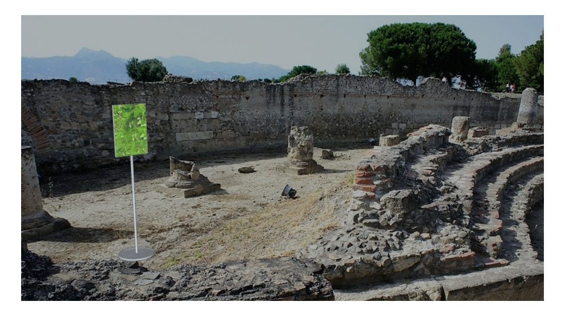
Figure 10: The marker.

Figure 11 shows how the point of interest viewed by means of a mobile device appears and is re-elaborated by the application of augmented reality.