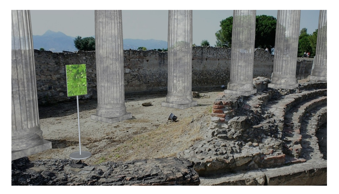
Figure 11: The 3D model.

Figure 11 shows how the point of interest viewed by means of a mobile device appears and is re-elaborated by the application of augmented reality.