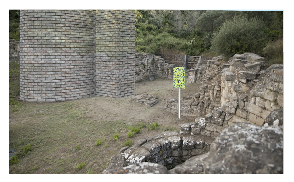
Figure 7: The 3D model.

Figure 7 shows how the point of interest viewed by means of a mobile device appears and is re-elaborated by the application of augmented reality.