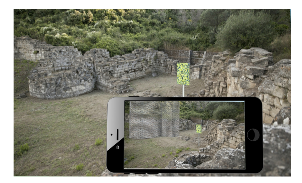
Figure 8: The mobile app.

Example of the application of augmented reality for a POI in the archaeological park of Sibari. We report an example of a point of interest to be enhanced through the use of a 3D model in the archaeological park of Sibari (Figure 9).