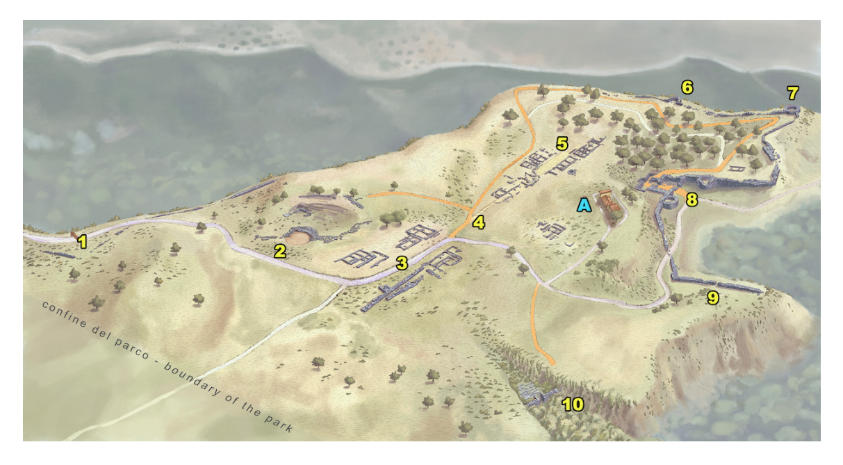
Figure 3: The map of the Archeological Park of Castiglione di Paludi