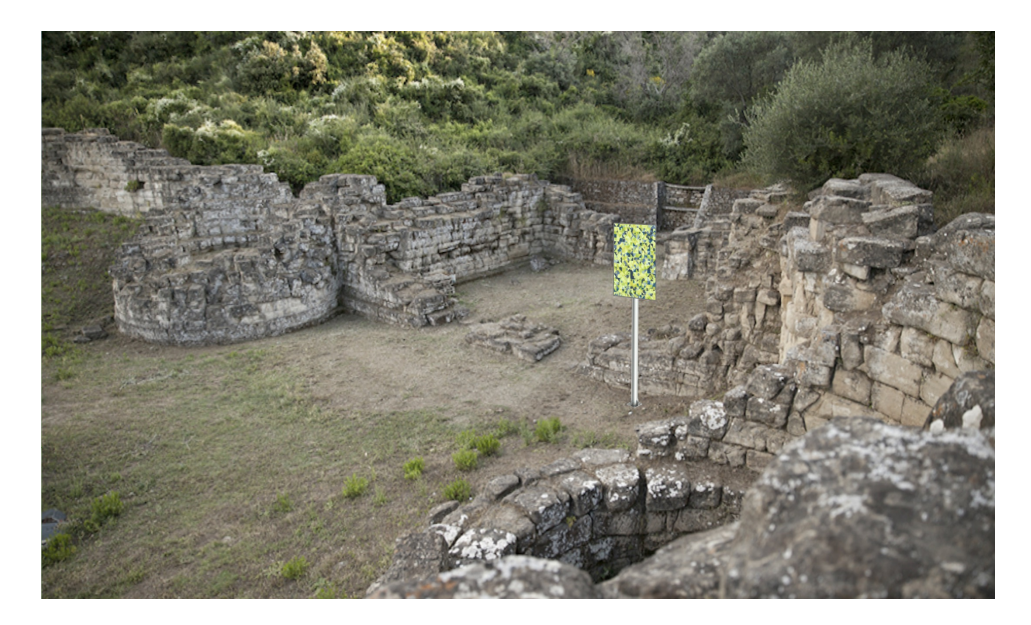
Figure 6: The marker.

Figure 7 shows how the point of interest viewed by means of a mobile device appears and is re-elaborated by the application of augmented reality.