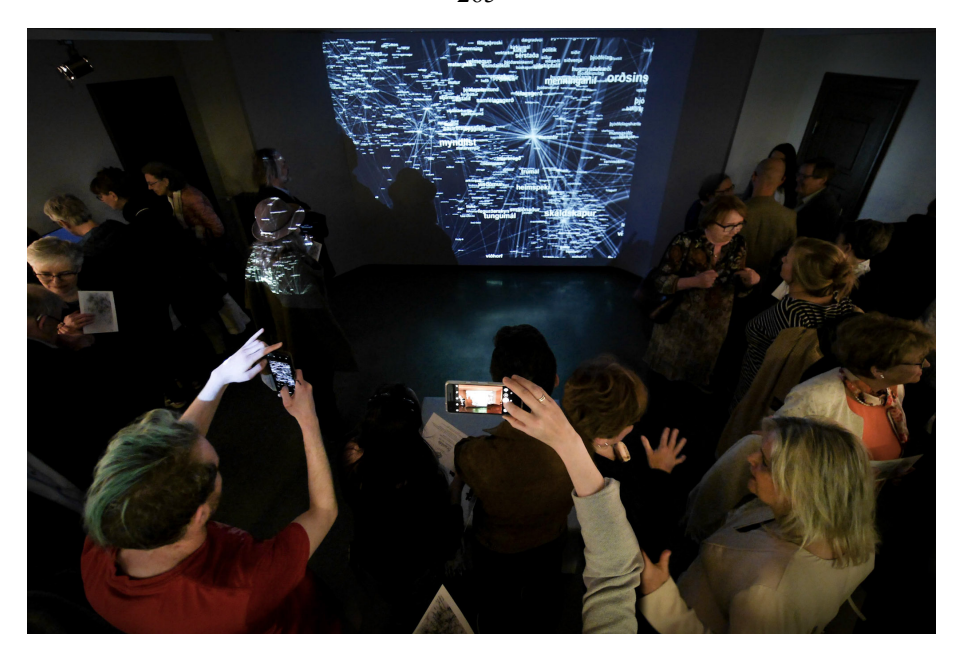
Fig. 3. Guests at the exhibition opening.

others that are less used but nevertheless interesting. By utilizing visualization and interaction we hope to raise interest in the language and creative language use among younger generations.