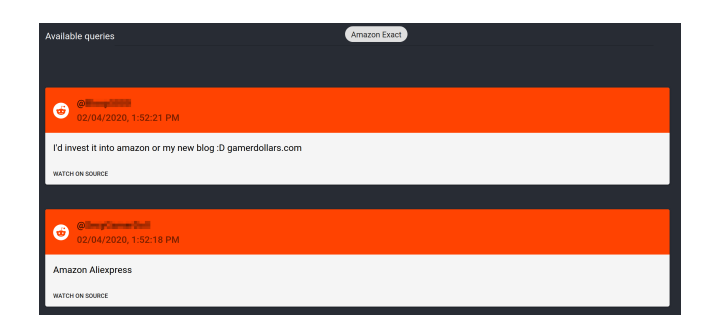
Figure 3: Filter view of the EXTREAM GUI.

the CiTIUS-Research Center in Intelligent Technologies of the University of Santiago de Compostela as a Research Center of the Galician University System.