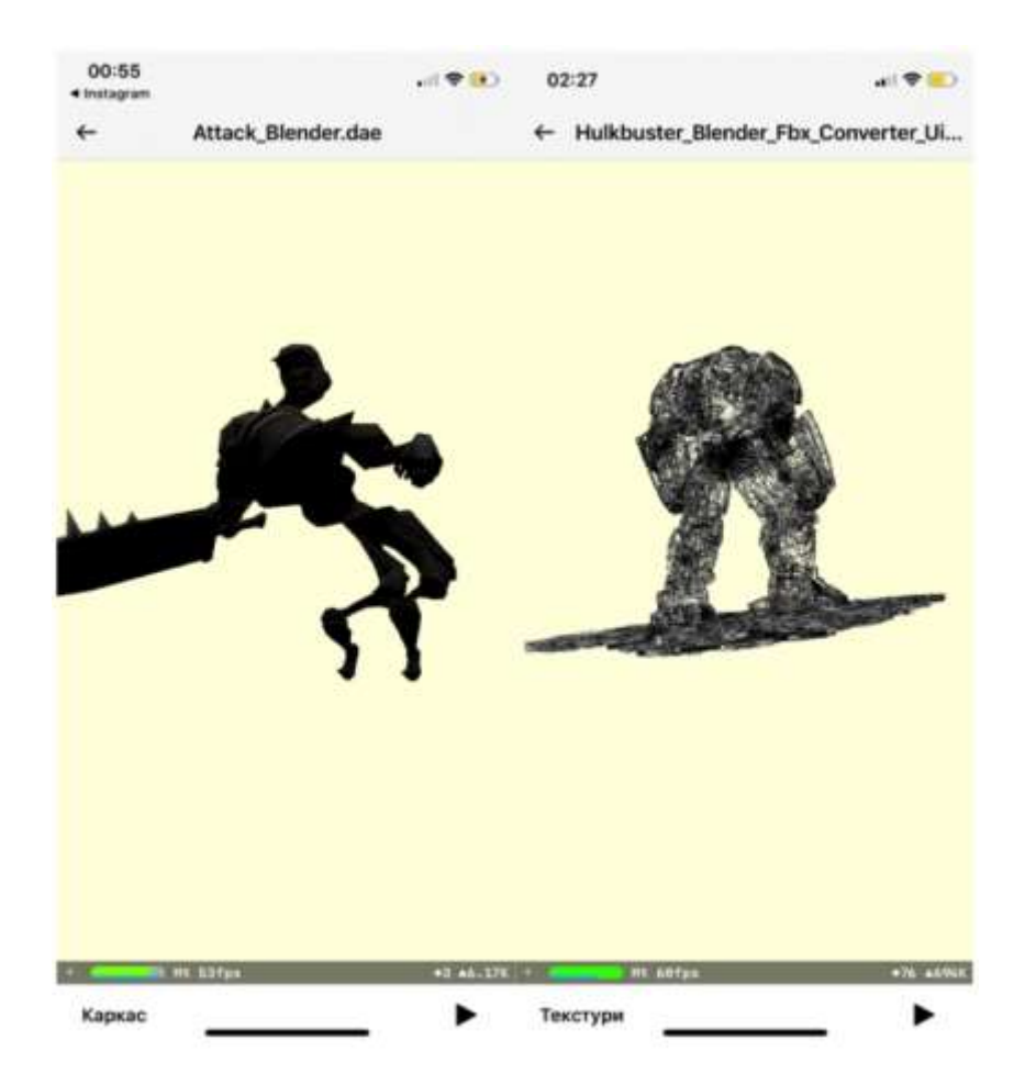
Fig. 5. Three-dimensional models converted from Fbx to Collada format

As for the FbxConverterUI program, it often crashed. It is related to the outdated version of the given program (last release 2013) and as consequence absence of support of models on the basis of new versions of Fbx though it and official software from company Autodesk. Also, the convertible models of this program deformed the distance of the models from the center of the camera, so it was difficult to manipulate them. The conversion results are shown in Fig. 6. The model of the dragon could not be converted to the Collada format by any of the programs.