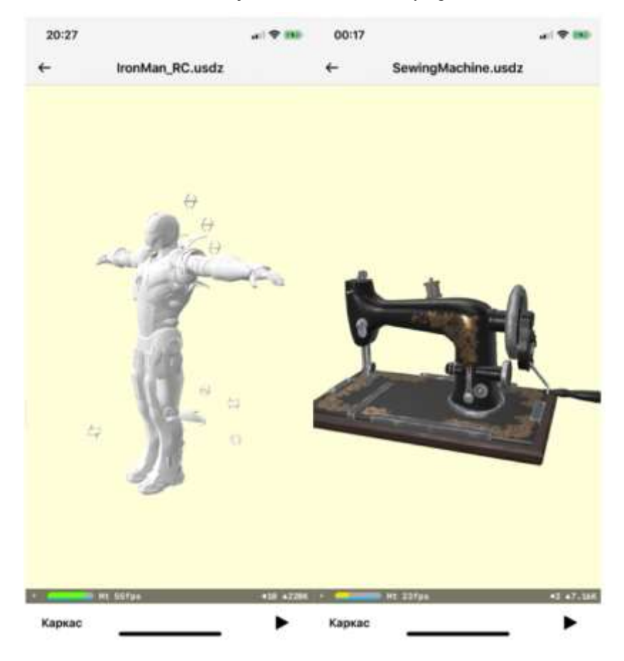
Fig. 1. Results of converting Object files to USDZ using Reality Converter

At first the models of Obj type were considered. As "objects of this model do not contain animation". [5, pp. 326-327] so only the image quality of static files after conversion was evaluated. When converting to the USDZ format with the Reality Converter application, no collisions occurred and both models were displayed correctly, as can be seen in Fig. 1. It should be noted that this converter does not use a .mtl file that stores information about the color of objects, but allows overlaying textures.