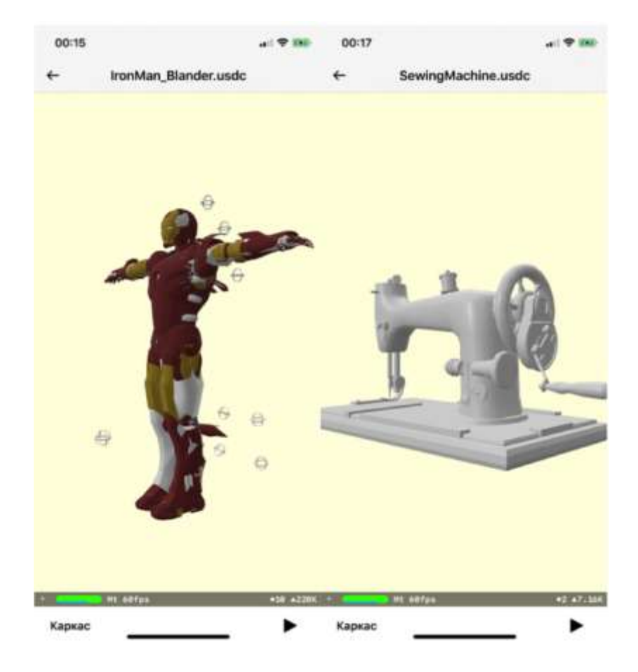
Fig. 2. Results of converting Obj files to USDC using Blender

Also, during the experiment, it was found that the final USDC file of Blender takes more memory than the USDC file inside the USDZ file, which is the result of the Reality Converter conversion.