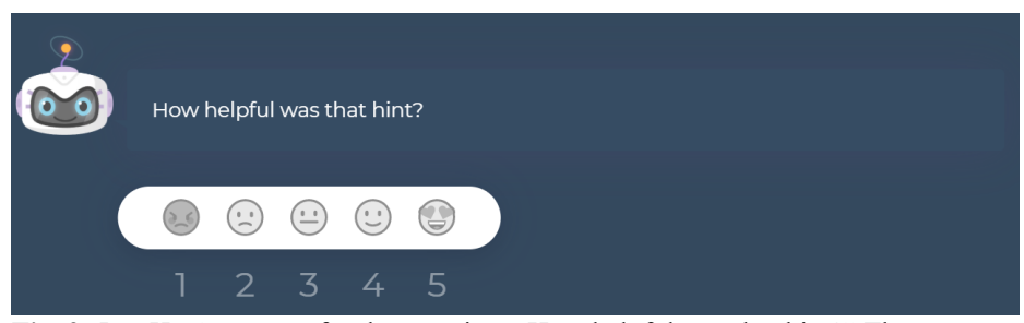
Fig. 2. LiveHint 's prompt for the question, "How helpful was that hint?" The prompt provides five emoji facial expressions for possible student responses to the question.

facial expressions ranging from an angry face (a rating of 1, "not at all helpful") to a wide-mouthed grin with hearts for eyes (a rating of 5, "exceedingly helpful"). While not a direct measure of learning, we take learner satisfaction as a preliminary proxy for hint effectiveness. In the future, we plan to explore questions of whether (and the extent to which) learner satisfaction ratings for hints correspond to the effectiveness of these hints in improving problem solving and other learning outcomes.