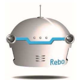
Fig. 1. Rebo – the reflection guidance chatbot: This is the design for the image of Rebo, the reflection guidance chatbot. Rebo Junior, the computer-mediated dialogue structure described in this paper, has the same visual appearance as Rebo, since Rebo Junior will successively change into adaptive, more intelligent versions of Rebo.