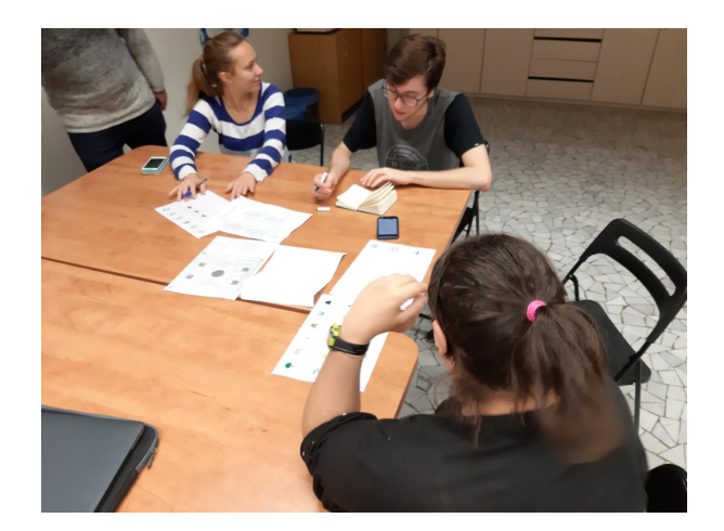
Figure 4: Interview with the therapists

design context. The subjects also commented on the game dynamics. They suggested to include tricks during the game to further engage the players (for example, traps or going back a number of positions). They appreciated a lot having missions, because they provide guidance through the game and set a goal. One subject suggested adding a new (super-)mission for helping the other game participants to conceive their new ideas. This is an indication that they grasped the collaborative spirit of the game, till the point to think about a specific role to encourage ideation by every participant.