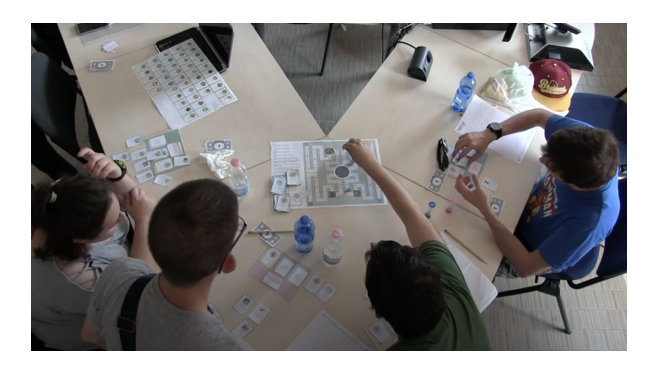
Figure 3: Familiarization workshop