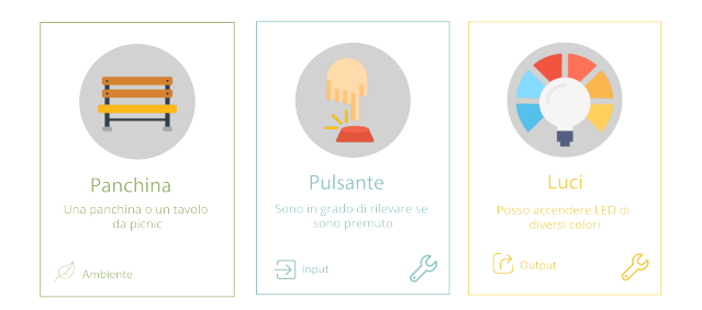
Figure 1: SNaP Cards