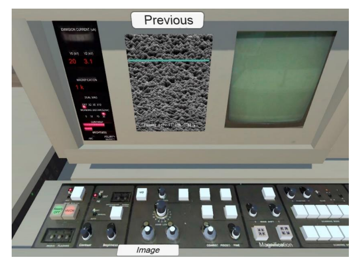
Fig. 2. Interactive 3-d model animation module.