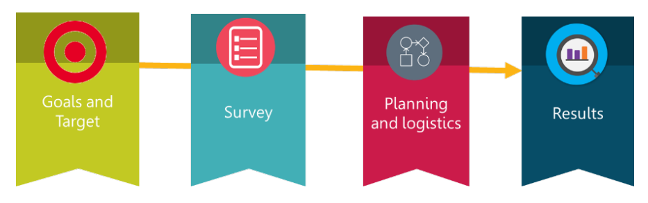
Figure 1: Development survey phases

To carry out the survey we considered three possible ways of realization: traditional mail (paper physical support), electronic mail or telephone contact. In order to achieve the greatest possible number of responses, in the shortest possible time, with a high degree of reliability, coupled with the fact that the length of the questionnaire does not imply a large expenditure of time, we opted primarily for electronic mail.