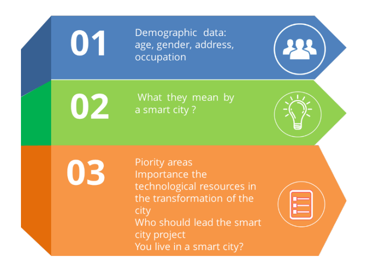
Figure 2: Survey groups organization.