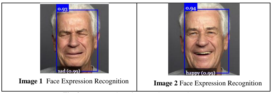
Fig. 3. Demonstration of an Emotion Detection output.

A demonstration of face expression Recognition of images from "FACES A database of facial expressions in younger, middle-aged, and older women and men" [30] is shown in Figure 3.