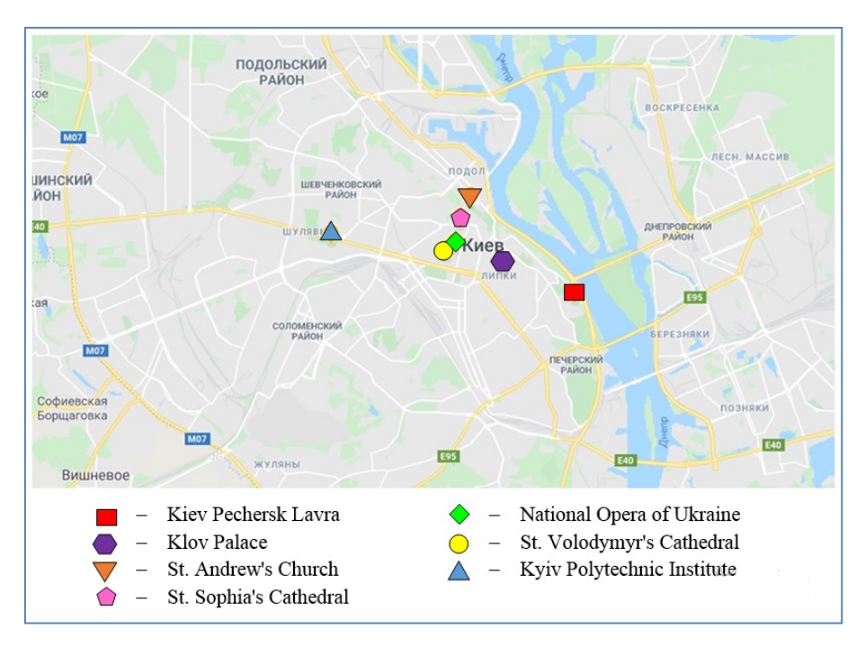
Fig. 1. Digital map of Kyiv with printed objects proposed for a virtual tour (Google resource).

First, we suggested that students include the use of a digital map of Kiev in the structure of a virtual tour, since the maps provide an understanding of the integrity of the territory with objects located on it and possible connections between them. They form a sense of scale and improve spatial orientation. Using digital maps, students can easily create virtual sightseeing tours, combining sightseeing objects with routes according to certain signs: the chosen topic, the chronological period, the place of a historical event, the sequence of location, the logic of movement. In our study, we used the Google Maps application as a tool for creating a virtual tour map. One of the advantages of this tool is the ability to clear the position of the excursion object on the map using built-in search tools based on addresses. Colored markers were superimposed on automatically identified points on a digital map to conveniently identify each virtual tour object. At the location of the excursion objects, we applied color marking for convenient use (fig. 1).