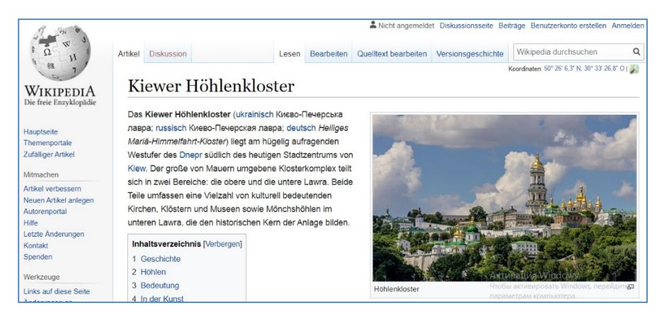
Fig. 3. A fragment of a web page with textual information about the bell tower of the Kyiv Pechersk Lavra, access is generated by a QR code.

especially important. In order for the image to be used in a virtual tour, they must be presented in digital form. The range of such images can be very diverse and range from simple photographs to interactive maps, managed panoramic images, 3D images and the like. Image types such as satellite images are also well suited for inclusion in virtual tours. The use of mobile devices in the process of conducting virtual excursions with access to images about the object has significant advantages compared to providing these images in print, primarily due to the possibility of increasing images, changing their brightness and contrast, making even small details visible. When preparing virtual excursions, students sought to provide access through a QR code not to individual images about the object, but to a collection of photographs that would allow them to get the most out of a particular architectural landmark (fig. 4). For this purpose, students used the resources of Google Images, Wikiway and the like.