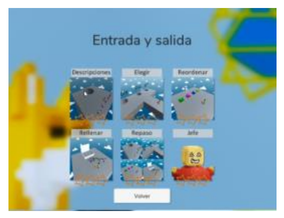
Fig. 3. Input/output level

For each main concept to teach, there is a world: I/O, conditionals and loops. All worlds shared the same structure: four minigames (descriptions, choosing, reorder and fill in the gaps), a review level and a boss as a final challenge as it shown in Figure 3 and as it was requested by school students as the users following a User Centered Design [10].