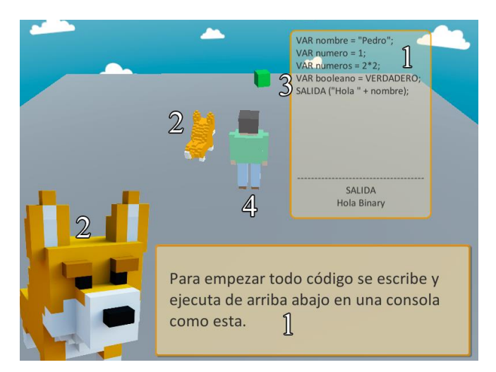
Fig. 2. Develop Learning screenshot

When students were asked if they wanted to have help in the system, most answers told that they wanted to have an animal pet. This is why in the videogame the user represented by the character (4) comes along with a dog as a pet named Binary (2) which guides them through challenges that has to overcome through pseudocode programming.