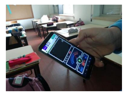
Fig. 1. Collecting data with the smartphone Decibel X app (WR, Group 1, p. 7).

ideal sound conditions to be able to be exercised with minimal quality" (WR, Group 2, p. 1). The students of grades 5, 6 and 8 measured the sound level in several school locations, using Decibel X app (Fig. 1). Group 4 chose thermal (dis)comfort problem to work with 6^{th} graders who measured the temperature using sensors (probes), in several days of January, hours and school locations. The students also answered a survey on thermal comfort sensations.