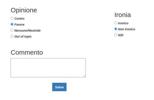
Figure 1: Platform for the annotation of tweets.

We created a web platform for annotation purposes, see Figure 1, in order to facilitate the labelling task to the annotators, unifying the visualization mode and shuffling the tweets in a random order.<sup>3</sup> 12 different native Italian speakers with an interest for news and politics were involved in the annotation, according to detailed guidelines we provided with examples for annotation and examples in their native language. We randomly shuffled the annotators and matched them into 66 pairs in which each pair would annotate 55 tweets. As a result, each annotator labelled 605 tweets independently and each tweet was annotated by two annotators, who had to choose among four different labels: AGAINST, FAVOUR, NONE/NEUTRAL and OUT OF TOPIC.