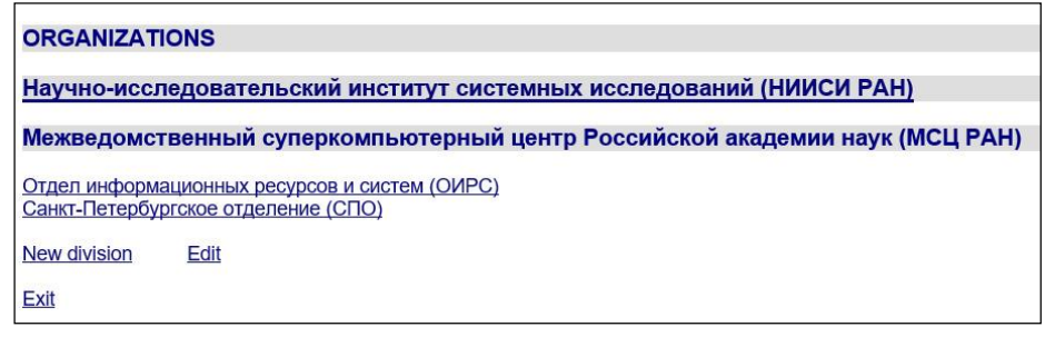
Fig. 3. Administrative block. Editing an organization

It should be noted that the metadata of organizations in the system is presented in the form of a hierarchical structure: an organization can include units that have departments, which, in turn, can include laboratories, etc. The system administrator enters the name of the organization, then the names of its departments, then links the names of departments to organization, etc. In fig. 3 shows the interface for editing organizations on the example of the organization "Scientific Research Institute for System Analysis of the Russian Academy of Sciences (SRISA RAS)". Here you can edit the names of the organization and departments, add (or delete) departments at any level.