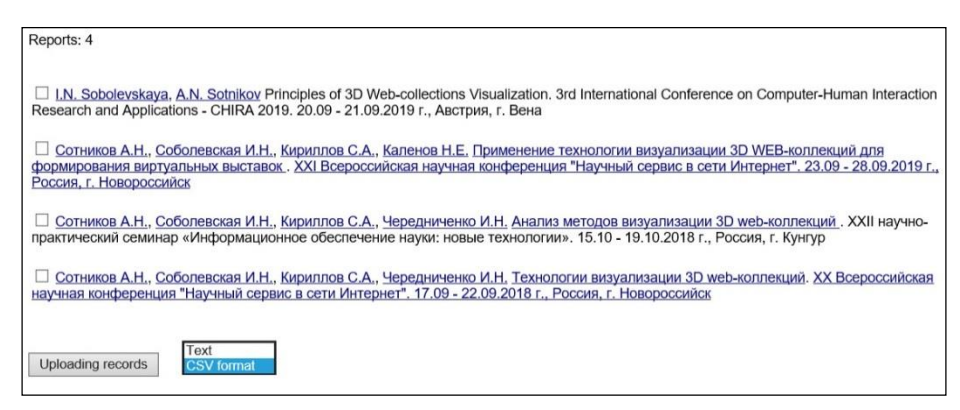
Fig. 6. List of found reports

If the address of the site with additional information about a particular report is known and entered into the system, its name in the list (Fig. 6) will be presented as an active link, by which the user can go to the text or presentation of the report. The link from the name of the event opens event website.