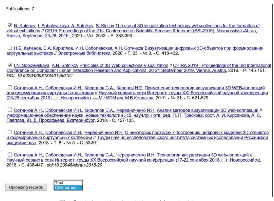
Fig. 5. Bibliographic descriptions of found publications

Publications are issued in the form of standard bibliographic descriptions, in which the authors and names of journals (collections) are active links (Fig. 5). In the event that the publication metadata contains a URL to the full text of the publication, the title of the publication will also be an active link, following which will open the article in a new browser window.