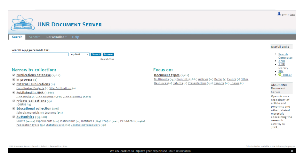
Fig. 2. Web interface of the JINR Document Server.

The JINR Document Server (JDS — jds.jinr.ru) [7] is an information system representing an Open Access institutional repository (OAR) of articles, preprints and other materials that reflect and facilitate research activities at JINR. JDS is based on the Invenio software platform developed at CERN (formerly known as CDS ware and CDS Invenio). Invenio represents an all-inclusive application framework, which allows running a fully functional digital library server [8]. The first version of JDS was deployed in 2009. The goals of JDS are to store JINR scientific information resources and provide effective access to them. The web interface of the repository is shown in Fig. 2.