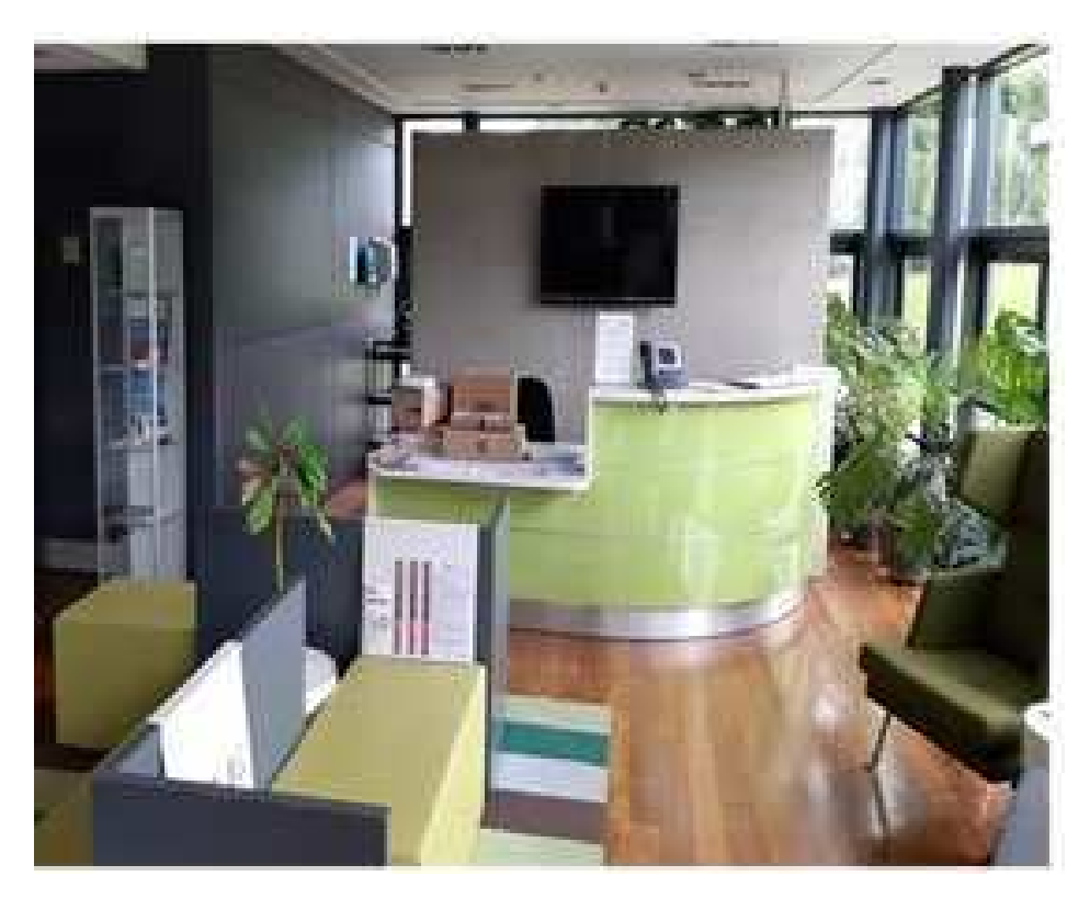
Fig. 5. Example area with many obstacles BLE was deployed