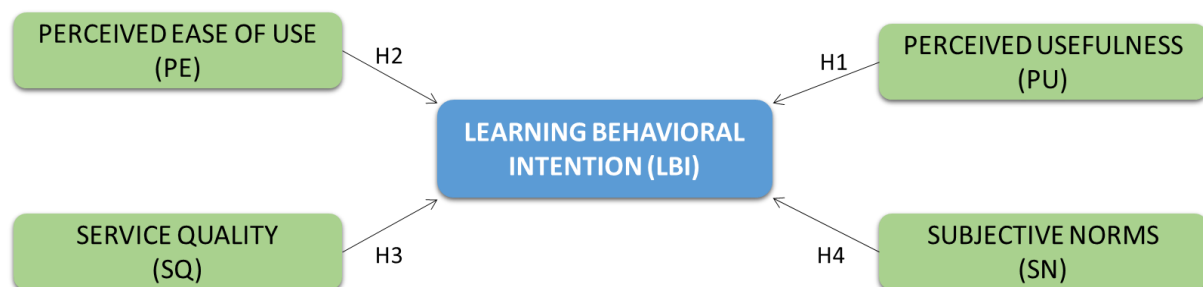
Figure 1. Conceptual Framework

The conceptual framework according to the given literature is illustrated in Figure1.