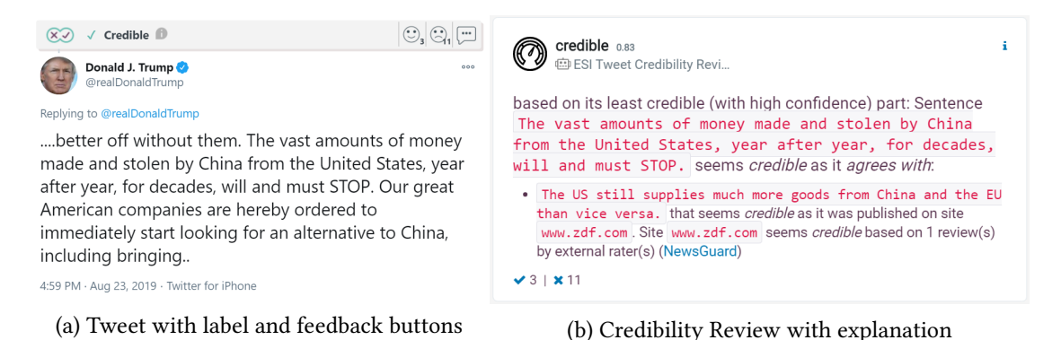
Figure 2: Example UIs for a (dis)agreement task for a tweet. The user can provide feedback about correct or incorrect labels predicted by acred.