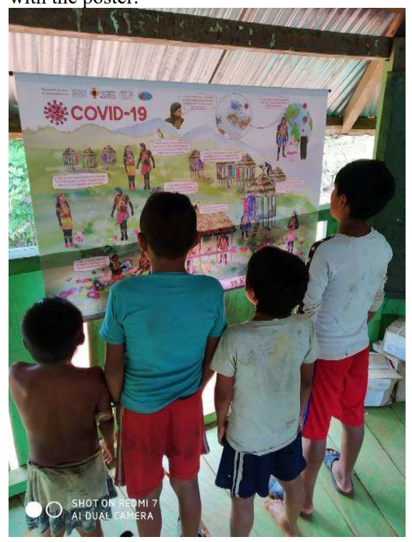
Figure 2 : Placement of the poster in the community center.

The poster was placed in community areas where people normally gather to discuss community matters. Figure 2 shows the poster displayed in a common area of one of the communities. The researchers would place the poster in the morning and explain to the community what the main recommendations were, then they would conduct tests and attend to other medical matters, and finally they would informally interview different members about their impressions of the posters. They would then complement these reports with their own observations and photos of people interacting with the poster.