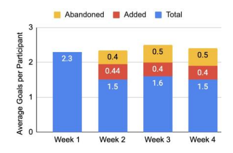
Fig.1. Average total, added, and abandoned goals per participant per week for 4 weeks.

The results for the total chosen, added, and abandoned goals for each week are in Figure 1 and the results for the total chosen, added, and abandoned goals for each participant are in Figure 2.