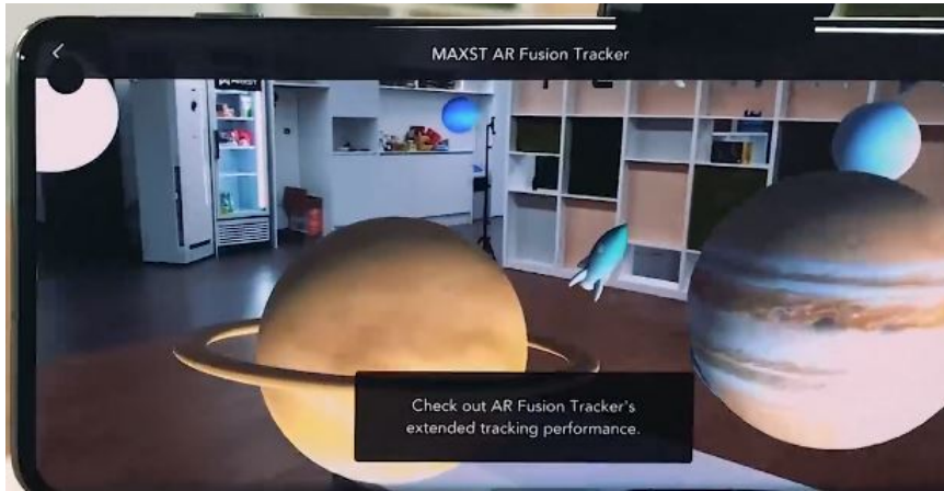
Figure 3: Maxst.