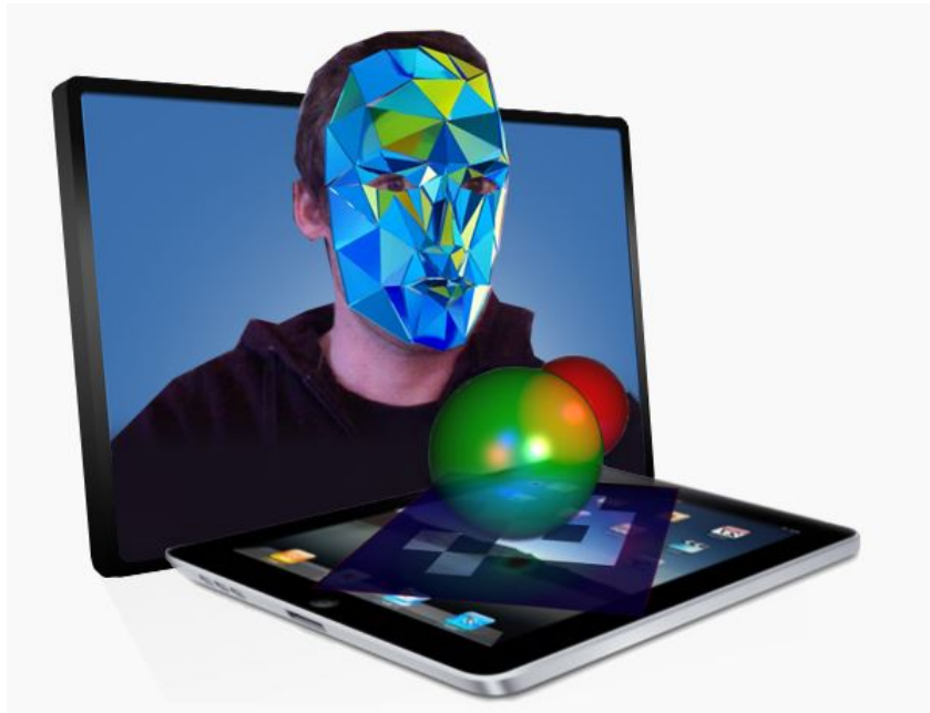
Figure 4: Xzimg.