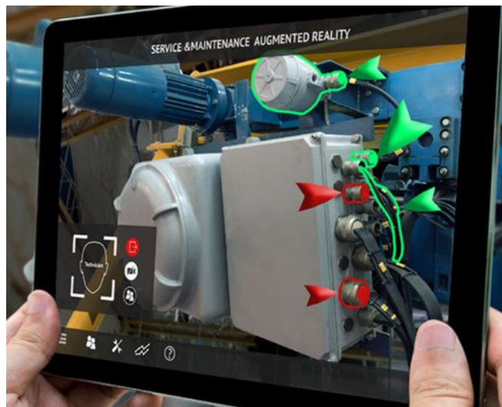
Figure 2: Vuforia.