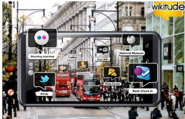
Figure 1: Wikitude.