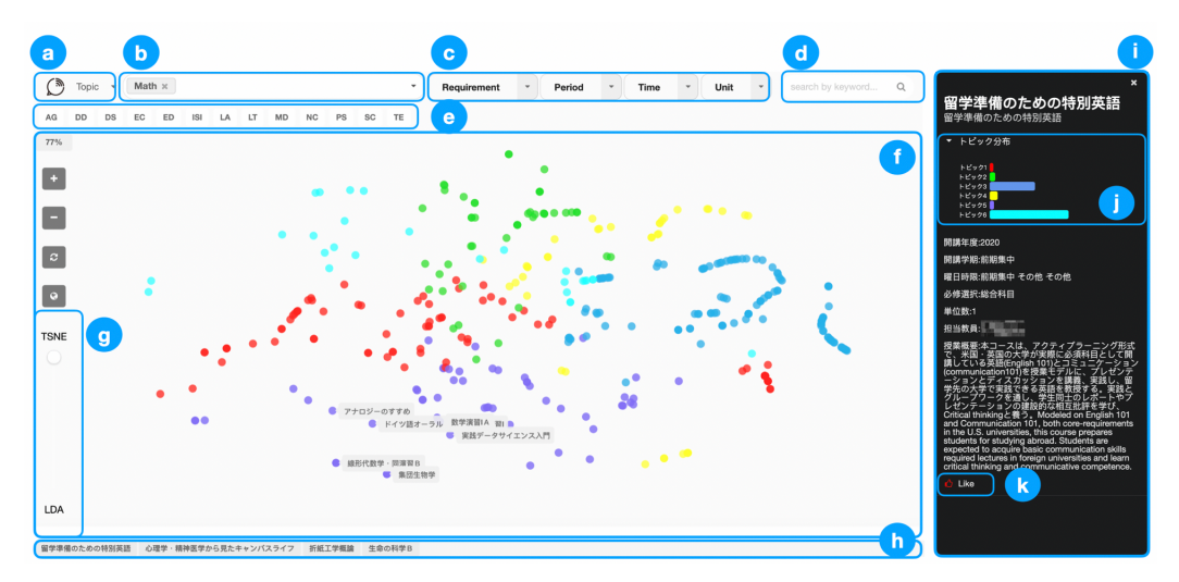
Figure 1: The screenshot of the CourseQ. The interface supports the exploration of recommended courses in left and detail inspection in right. (Some text is in Japanese, and the instructor's name has been pixelated for privacy protection).

tions are displayed as the corresponding course nodes and their labels are highlighted within the visualization. We hope that the ability of interactive visualization could explain the recommendation results and help students to explore more within the latent space. In terms of topic number, we find that too many topics may hard to visualize and colorize while too few may cause poor performance, as a result, we set 6 as a practical number in our follow-up experiments. It means that a course will be represented by a vector with 6 dimensions.