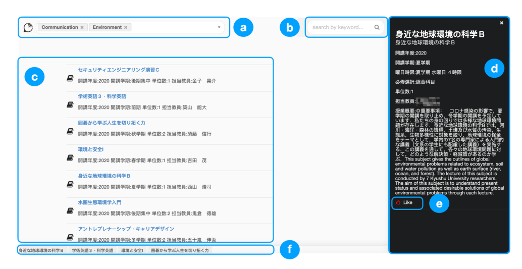
Figure 2: The screenshot of the baseline application. The interface shows recommended courses in left and detail inspection in right. a) Keyword input, b) Search bar, c) Ranked list, d) Information sidebar, e) Like button, f) Like list.

provide immediate feedback and control the system to generate a more personalized result.