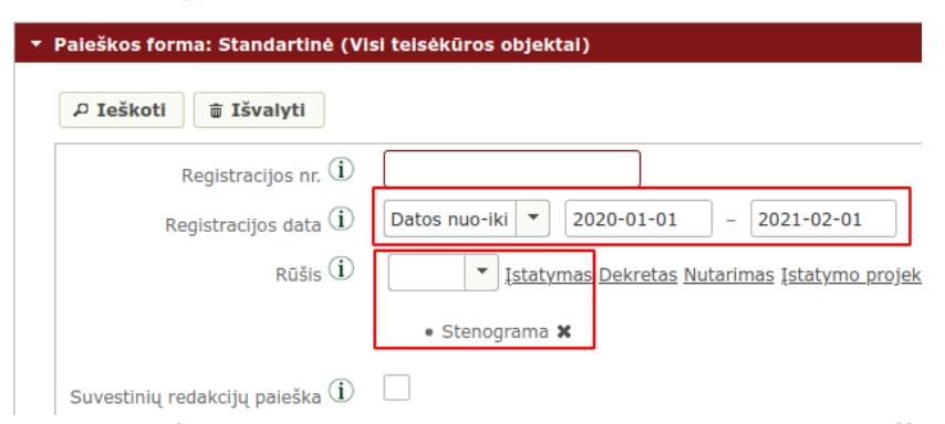
Figure 1 : Query for debates transcripts retrieval implemented on the official document search site of the Seimas.

The retrieved files had to be converted into textual data files (plain text format) to be processed with text analytic tools. It should be noted that the entire data set is in Lithuanian; therefore, it was essential to preserve the UTF-8 encoding for further processing. Information about the number of tokens per month and session are provided in Table 1 below.