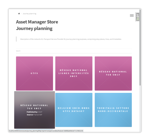
Fig. 3: Visualisation of both local and remote NAP assets in the Asset Manager.

API. As a result, this solution can encourage and facilitate the creation of multimodal mobility packages providing standardised access to information coming from several metadata sources.