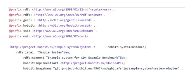
Fig. 4. An example of system meta-data file.

files using our script at "src/kge_output_to_data.py". To test the System on the Benchmark we setup the docker image that contains both the implemented system and the trained embedding vector files. <sup>7</sup>.