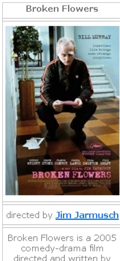
Fig. 2. Excerpts from the Revyu HTML page about the film Broken Flowers, showing the film poster, director information, and summary drawn from DBpedia 10

retrieved from RDF exposed by the Open Guide, and used to show a Google Map of the items location (see 9 for an example). The same approach can also be used to expose address, telephone, and opening time information held in the Open Guide.