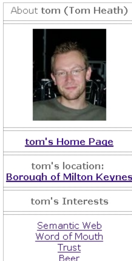
Fig. 3. Excerpts from the first author's Revyu profile page, showing data sourced automatically from his external FOAF file 11