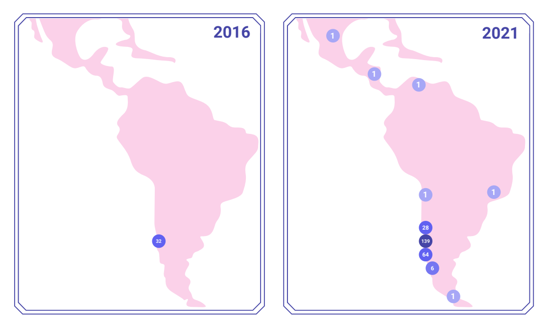
Figure 2: Students enrollment in Niñas Pro. The map highlights the number of students per geographic location of the annual Empower Project course.

The number of enrollments in the Niñas Pro activities has increased over the years. In 2021, the number of girls enrolled in the annual Empower Project course reached 245. These students are geographically distributed throughout the country, and even encompassing other countries such as Panama, Mexico, Venezuela and Brazil as shown in Figure 2. The figure represents how much our organization has grown, not only in terms of numbers, also geographically.