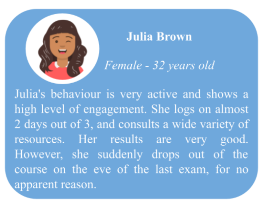
Figure 2: Outlier persona - Withdrawn dataset

Next, one of the outliers of the withdrawn dataset ( Figure 2 ) shows an exemplary behavior at the beginning of the course with high activity (4267 clicks), a high regularity (178 active days), and curiosity (188 consulted resources), but gives up for the last assignment, which is not handed in.