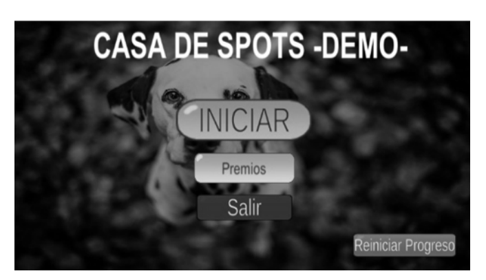
Figure 2: Main Menu

In this Phase, all sketches were adapted and used the Unity Editor software as well as including the gamified elements and questions needed for the videogame. Before testing with real users, all of the Unity scenes were internally tested to correct possible identified flaws and export the videogame to computer and smartphone devices. At one point during development, the name of the videogame was changed from "Casa de Casino" to "Casa de Spots" to avoid confusion with card games and ludopathy. As a matter of feedback, the president stated that the videogame should be useful to motivate and use it to learn differently.