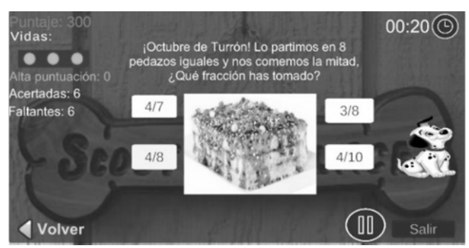
Figure 3: Current Level