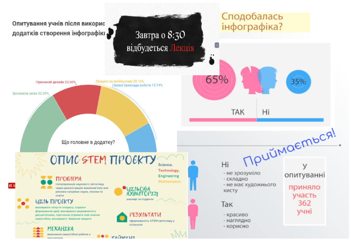
Figure 1: The results of a survey of students on the means of creating infographics.

translation services, the interface in English caused difficulties when using the application. In second place (28.2%) was the ability to work as a mobile application, because today the number of users through mobile systems exceeded the number of users through a stationary computer system. In third place was the design criterion (23.5%). And although the systems that were proposed were directly related to graphic design, the ergonomics of these systems still need to be improved. In last place was the criterion of "available examples of work" (15.7%). In our understanding, this is the "worst" criterion and it is gratifying that the smallest number of students is ready to do tasks on the model, because the capabilities of the systems are sufficient for creativity and creative presentation of information.