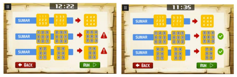
Fig. 2 . On the left: Test cases in which the student has failed. On the right: Successful test cases unlock the level and move on to the next.

The serious game: Engineers Escaping was implemented to achieve motivation in learning matrix-based programming, testing, algorithm design, and geometric transformations. Each game level is organized in chapters whose main character must go through, the user will find traps that must be avoided or deactivated. In this scenario, there are controls which requires solving puzzle to disarm the traps and progress while collecting crystals and clues that contain key information. The character will be able to jump, move left or right, open doors within each floor or level. There are specific saws such as electric, lasers, spiked platforms that made levels difficult. Additionally, the controls are designed to deactivate the traps in the room; these controls contain puzzles that must be solved to advance in the level. Upon reaching the door, students must press the "e" key, which will take the user to the first puzzle of the game, which requires deciphering the combination in a 3x3 matrix by pressing specific color-based boxes (See Fig. 2. Test cases).