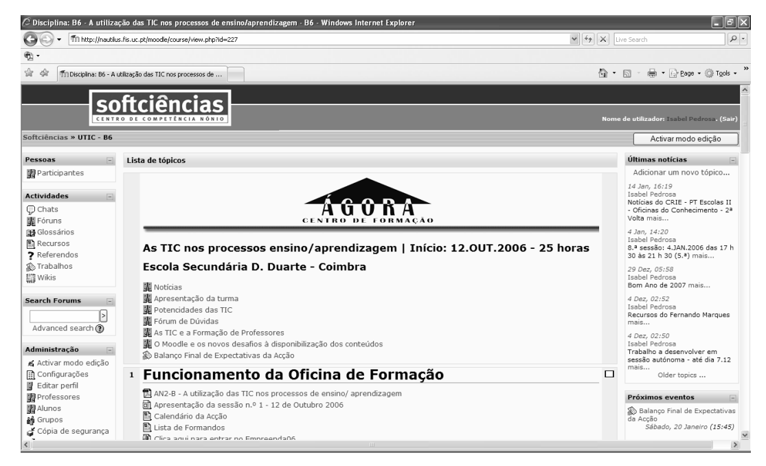
Figure 2. Moodle Course Example. Virtual support to B course-Centro de Formação de Professores Agora – Coimbra, PT (only available in Portuguese language)