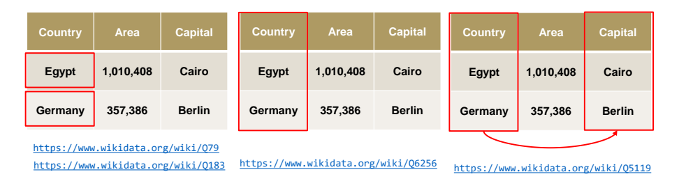
(a) CEA (b) CTA (c) CPA