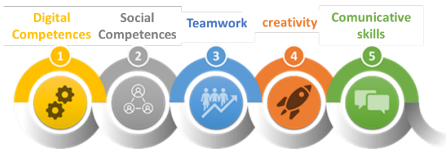
Figure 2: Competences acquired through the use of social media in education.

The tools currently used in universities, such as Moodle, are very useful tools that allow us to carry out many of the tasks required to implement a blended model. Figure 3 shows the functionalities provided by this tool.